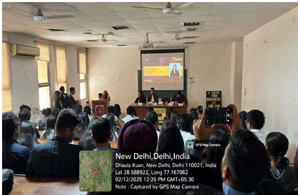
Entalk - the panel discussion - starting ripples, inspiring waves and driving change

2nd Position: Team Pitch Perfect, Gargi College