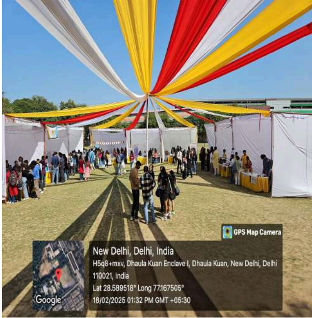
Stalls at the main ground