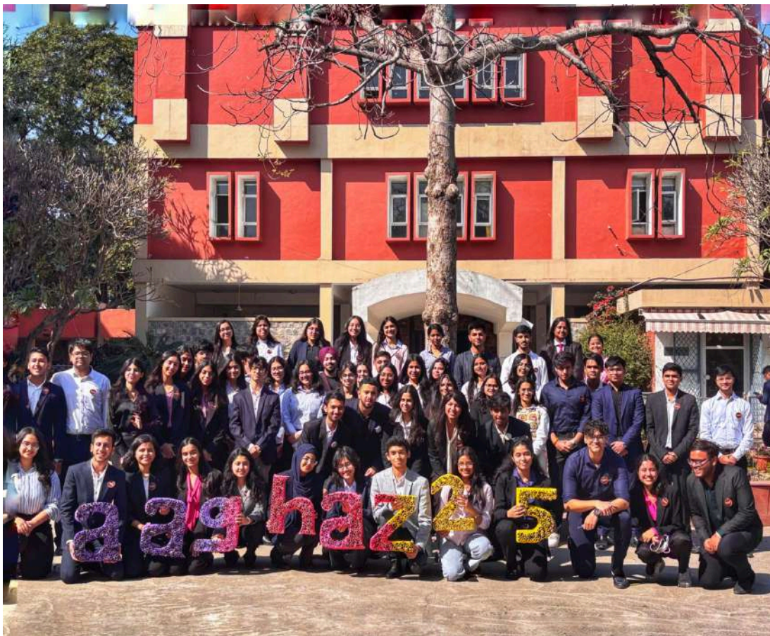
The Team of Enactus, Sri Venkateswara College

The annual event, Aaghaz'25, organized by Enactus SVC, showcased a remarkable fusion of innovation, collaboration, and entrepreneurial energy. Held on the 12th and 18th of February, Aaghaz'25 witnessed a dynamic convergence of students, entrepreneurs, and Enactus members, promising two days of electrifying competitions, insightful talks, vibrant stalls, and unparalleled networking opportunities. Under the theme of 'Where Dreams turn Golden,' Aaghaz'25 aimed to illuminate minds, ignite passion, and champion sustainability and social entrepreneurship.